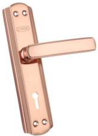
S606M Rose Gold