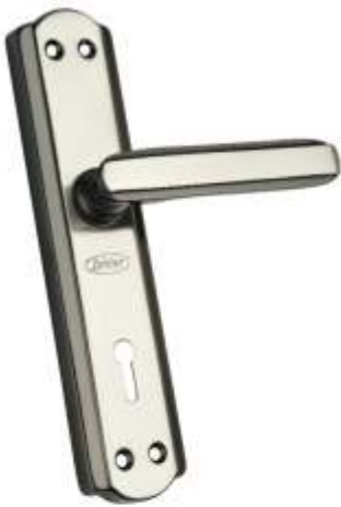
S606M Sil. Black