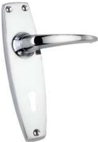
ZZ51MCP CP Zinc Alloy