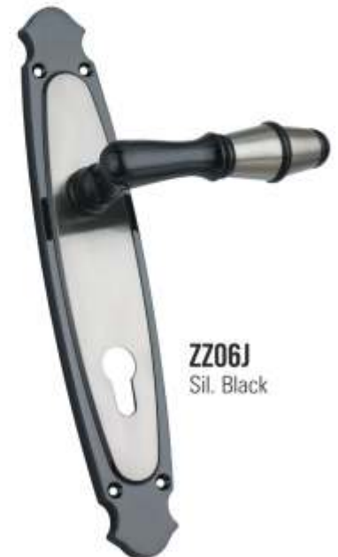
ZZ06J Sil. Black