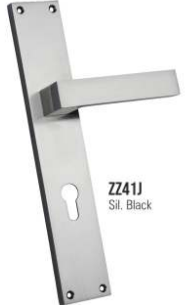
ZZ41J Sil. Black