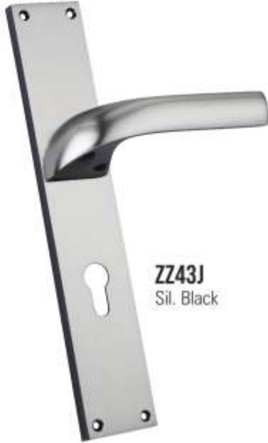
ZZ43J Sil. Black