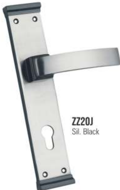
ZZ20J Sil. Black