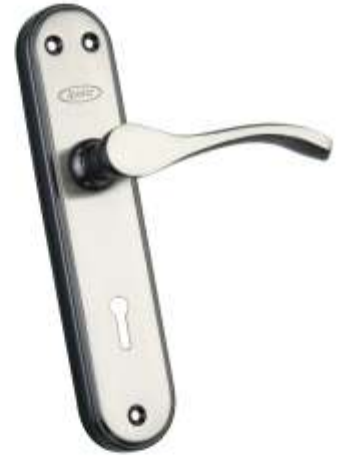
S115M Sil. Black