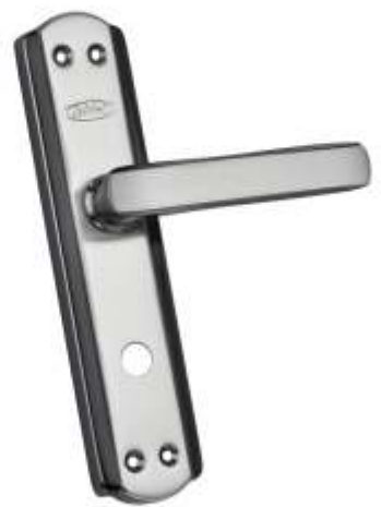
S606R Sil. Black