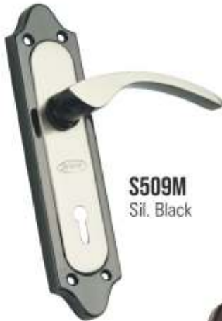
S509M Sil. Black